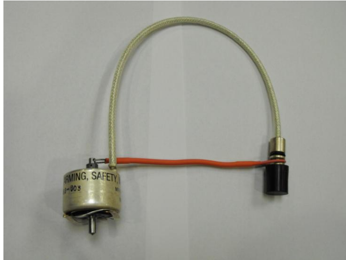
Figure 2: A Mk 122 Mod 0 Produced by OTS

OTS produces the MK122 Mod 0 to the most recent and recognized specification and model for this product, the LD516112. The LD516112 is a modern build of the original MK 122 under NAVSEA PN 2288036, utilizing material and processes that are superior to what was available at the inception of the safety switch. The LD516112 is useable across a larger platform of fuze systems, including the M990 series, MK255, MK 257, MK344, and MK376. The new design also reduces the possibility of premature circuit actuation due to spurious electromagnetic radiation.